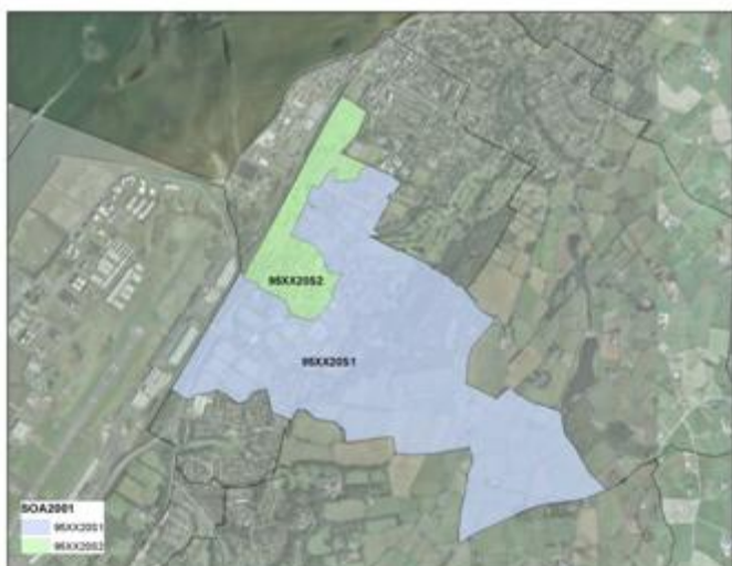
Old Super Output Areas

Maps of the Old and Modified Super Output Areas are shown below.