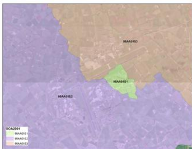
Old Super Output Areas

Maps of the Old and Modified Super Output Areas are shown below.