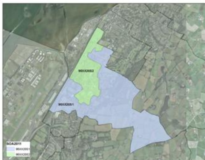
Modified Super Output Areas

This change may affect trend comparisons of statistics as the Central Postcode Directory was based on the Old Super Output Area boundary. The future Central Postcode Directory will be based on the Modified Super Output Area boundary. The 2001 and 2011 Censuses are unaffected.