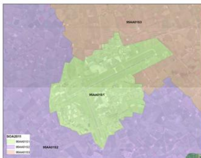
Modified Super Output Areas

This change may affect trend comparisons of statistics as the Central Postcode Directory was based on the Old Super Output Area boundary. The future Central Postcode Directory will be based on the Modified Super Output Area boundary. The 2001 and 2011 Censuses are unaffected.