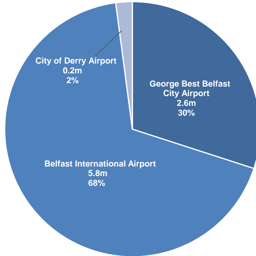
Figure 2: Total air passenger flow through Northern Ireland airports, April 2017 to March 2018